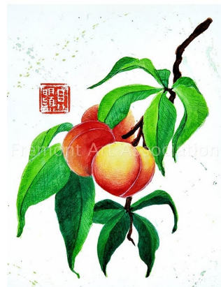
2nd Place MiaMixesMedia "Peaches"