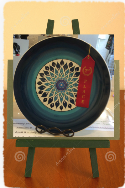
Second Place Helene Roylance "Burst" ceramic