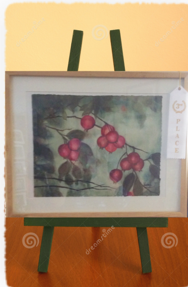
Third Place Vaishaly Jaiprakash "Red Berries" watercolor