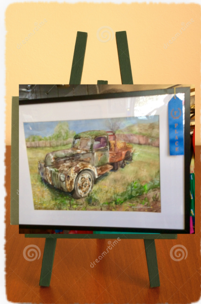
First Place Naum Reznikov "Retired" watercolor